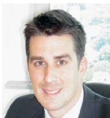
Franck Fougère Ananda Intellectual Property

The time may have come for a calm, clear-eyed and rational reconsideration of the necessity of the Thai government's policy on compulsory licences.