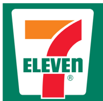
7-Eleven (stylized numeral)